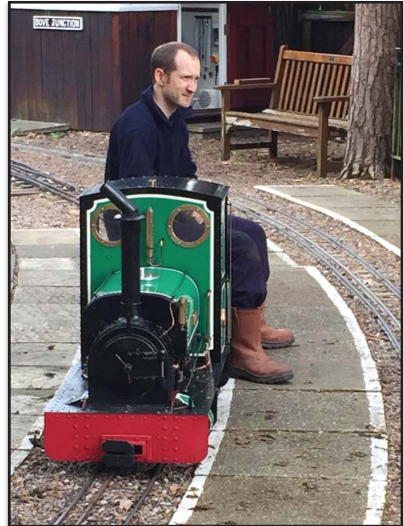
"Locos, can't live with 'em..."