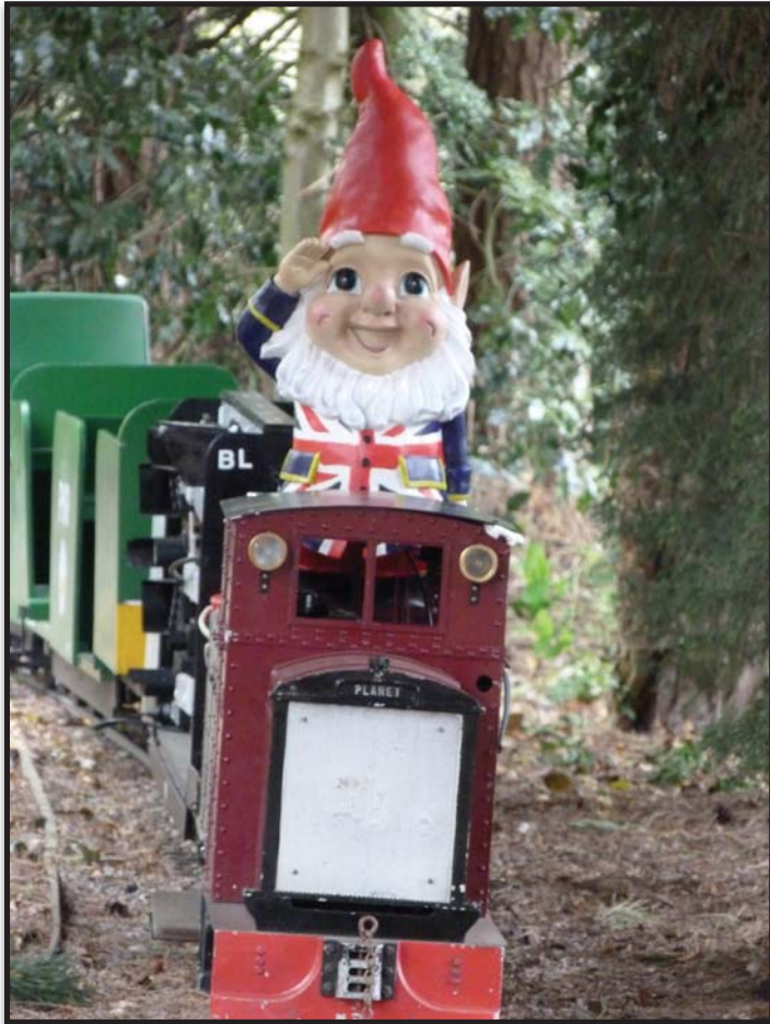
Gnigel gnome bringing in the signal truck

Welcome to the first edition of 2015. Thanks to some great submissions from our members and some outstanding images, this edition really is packed full of goodies! Please keep them coming in.