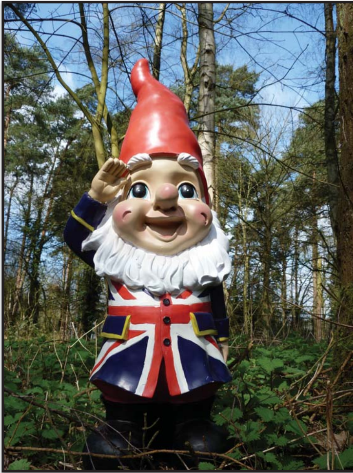
Gnigel saluting the passengers from his new home in the woods

After the success of the reindeer stables for the Santa Specials I had been looking to find some more things to put around the track to amuse the children (and big kids too). Imagine my surprise when a trip to my local Asda came up with the perfect thing. Giant garden gnomes! I immediately purchased a pair of them without any hesitation. To say they are a hit with the public is an understatement. I have since found out that Gnorman does in fact have a wife 'Gnorma' and 2 children 'Gnicola' and 'Gniel'. Maybe they will turn up at Pinewood sometime in the future, who knows?