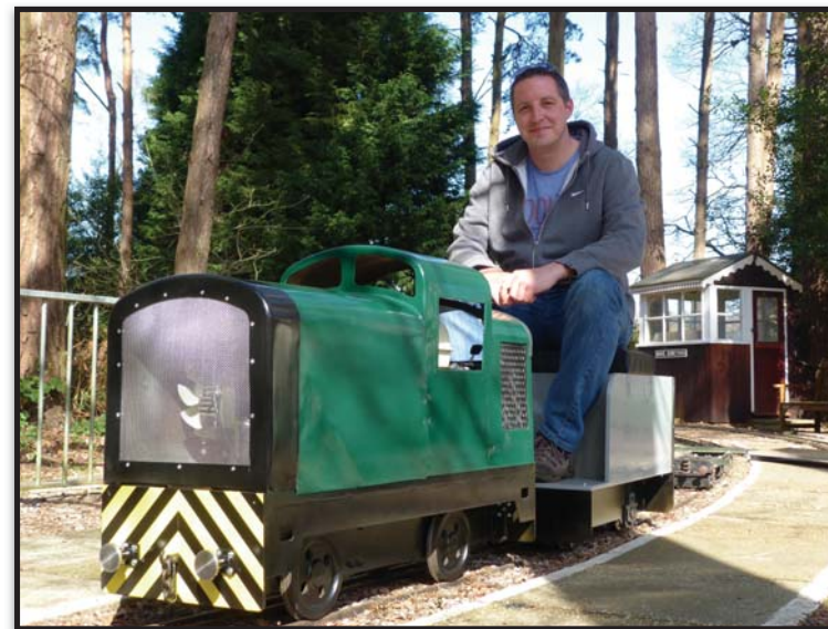
The loco in it's refurbished state

Unfortunately, due to a change in my personal circumstances, I was unable to commit the time to Pinewood and was absent for around two years as a consequence. Although I had made a start on the loco, it also fell to pretty much the same fate and spent most of this time in my garage.