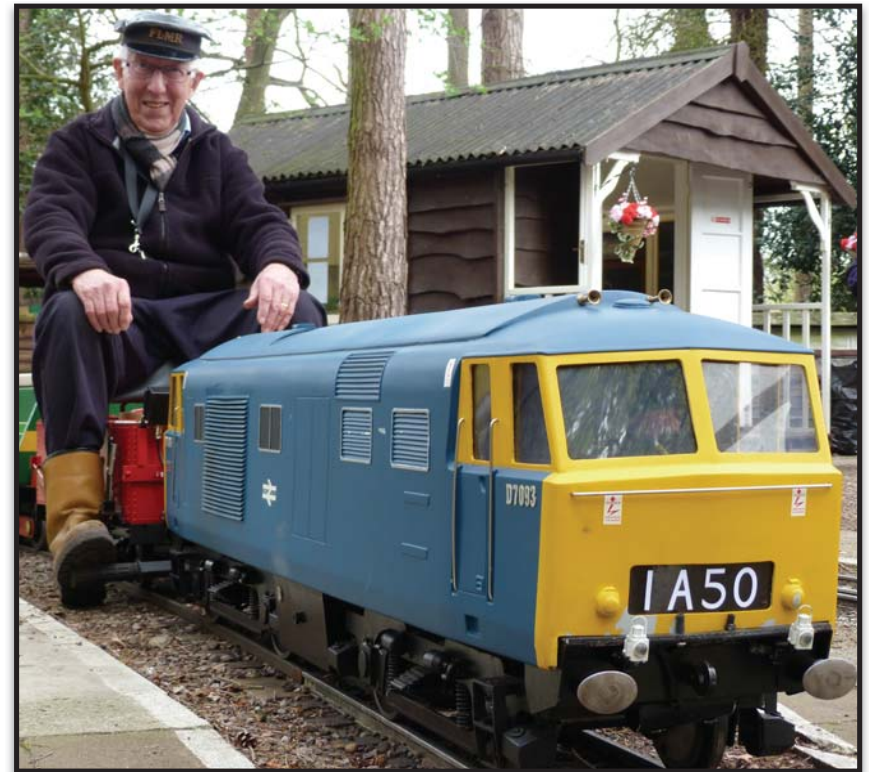
This month's cover star in all her glory

Whilst on the subject of public running please make a note in your diary that we have two additional public events that I hope you will support. The Pinewood site is holding a "Pinewood Festival" on Sunday 5 th July and we have agreed, as on previous occasions, to support the day by providing public running, and tickets as raffle prizes. We will need a good deal of membership support on this long day (including locos) so please come along and help out if you can. The second date for your diary is Wednesday 15 th July when we will be offering an hour of free rides to the children (and their mums) of the "Flying Start" pre-school adjacent to our site. This has become an annual event and enhances our "good neighbour" credentials and is also much appreciated by the children and the Pinewood site management.