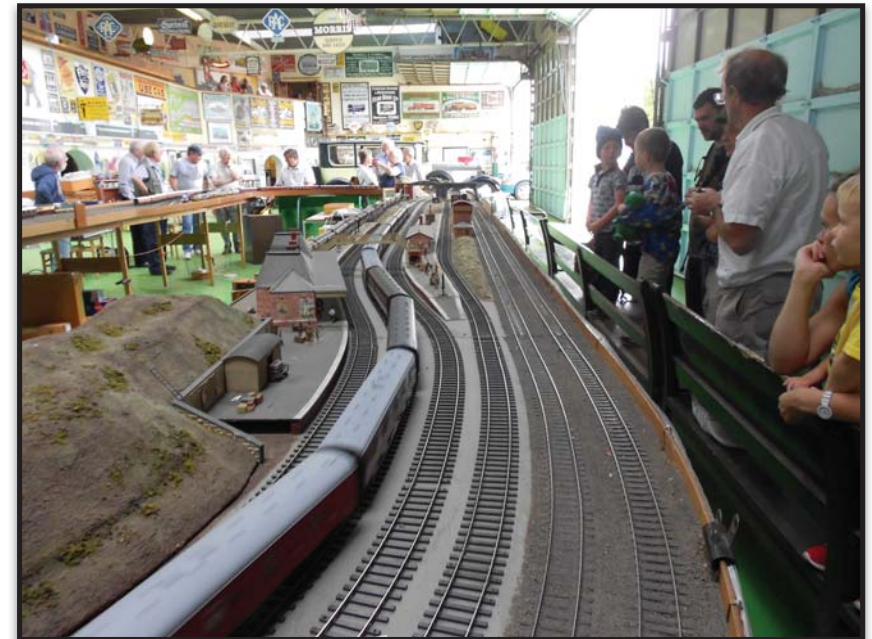
If only we all had enough room for a layout like this

Fawley Hill Museum is Sir William McAplene's collection of railway artefacts, including a short branch line for rides, a large 0 scale layout and half a dozen rooms full to the brim of historic objects from the golden age of Great Western steam. Everything was displayed very professionally and it took a long while to admire the models, signals, engines, clocks, signs etc that were there before a quick stroll to the other end took you to a large model railway room. On the ground floor, there was the main model layout which ran a variety of trains from all eras which varied throughout the day. I spotted a Victorian service, pre-grouping and Big Four steamies, "Gordon" from the Thomas & Friends franchise and British Rail diesels all side by side pulling impressive loads. All in all, there was a lot to see which could keep any railway enthusiast happy for an hour or two!