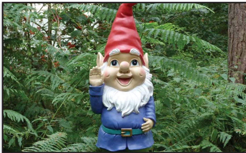
Everyone smiles at Pinewood, including the Gnomes!

"Took my 3 and 5 year grandchildren and they loved it."