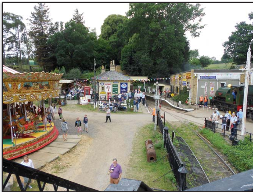
The view of the site from the footbridge over the line

The main appeal, however, was of course the short stretch of track on which rides were given to visitors. Several dozen people rode on the Great Western wagon or the Shark brake van – quite a squeeze, but it was all in good spirit! Hauling the train was the 03 diesel; a disappointment to some as previously a steam tank locomotive was promised to be on the front. However, the steam loco was kept on display outside and in steam though so the 102 year-old saddle tank could still be looked upon and appreciated. The train ride took passengers down a hill before it backed on to a straight line that passed fields of deer and alpacas. The train went up and down it once before taking the branch back up to the main station. The line was decorated with larger items in Sir William's collection, such as the two dummy stations at either end of the straight line section, Flying Scotsman's original tyres, the original LNER marker for the border between England and Scotland and a goods wagon shed filled with a variety of stock. These things don't sound like much, but they gave you something to look at and enjoy while on the trip. The journey was designed for the passengers and had lots of twists and turns which made a nice difference to other museums which can only offer a slow shuttle up and down a small section of track. Cab rides were also available and I was kindly given Pinewood's only slot (thank you Andy and Ray!) which proved to be a highlight of the day!