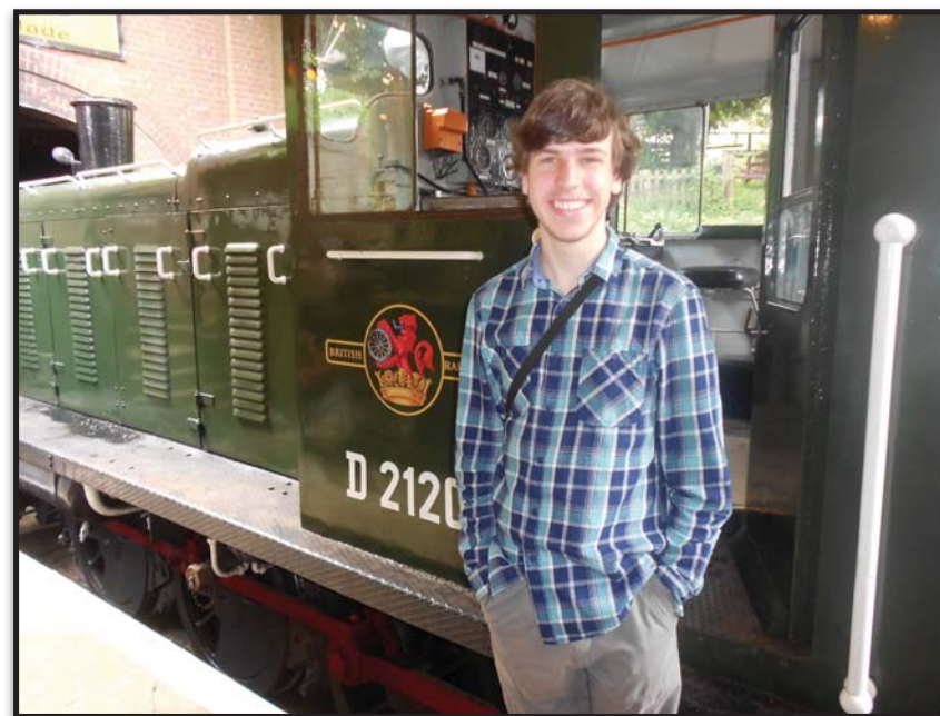
judging by that smile it was indeed a grand day out