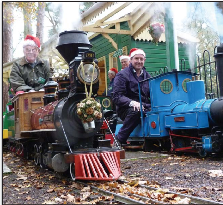
We have the trains, all we need now is a Santa or four!