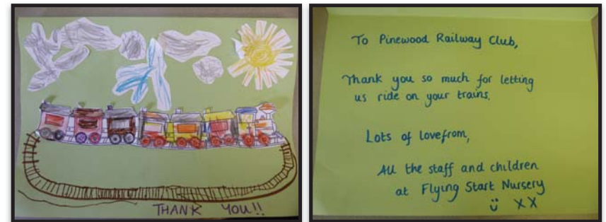
Our 'Thank You' card from the children of Flying Start Nursery

The problem of access to, and parking at, our site and other outstanding issues with the bollards have been resolved satisfactorily.