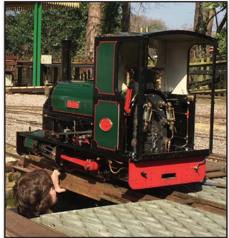
"Guys, this part seems to be working properly, pass me a hammer"