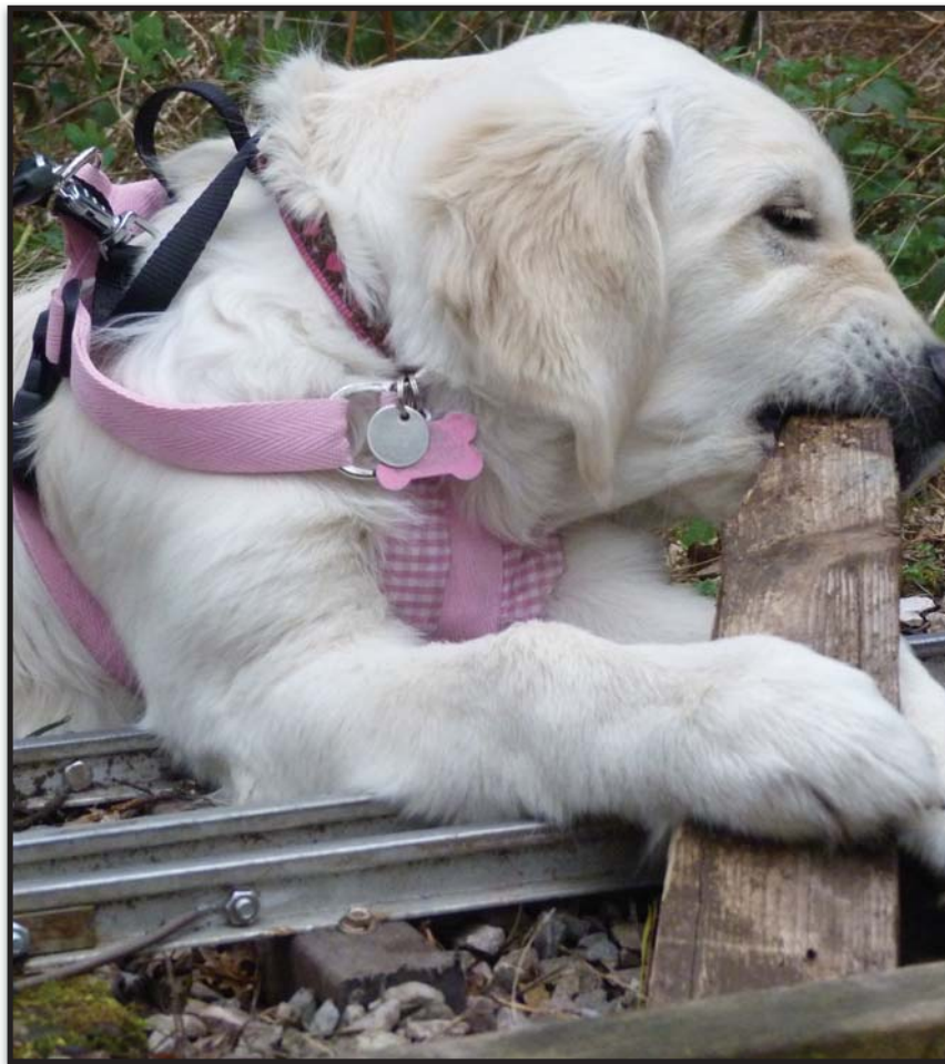
Our newest member of the maintenance team checks for rotten sleepers

Track levelling, edging etc continuous as a constant task. A few sleepers made from treated timber have found to be rotten. These will be replaced with plastic sleepers as the need arises.