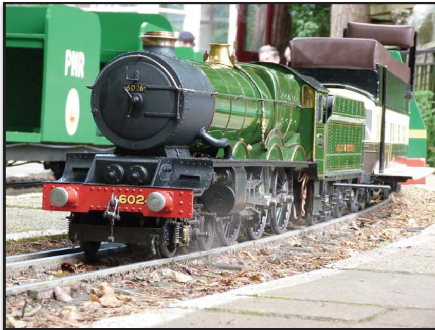
A King, at Pinewood - surely not? New member Tim Elliot's 'King John' joins the Pinewood lineup

Slow emptying of the sinks in the hut had become much worse in the last few months. Tim took the bull by the horns and removed the rack and steel plate covering the soak away to investigate. Martin excavated the complete pit and the problem was found to be tree roots growing over and into the drain pipes. All roots have been removed and the pipes extended so as to drain into the centre of the pit rather than the edge as before. All rubble has now been replaced and the pit recapped with the steel plate. Thank you Martin.