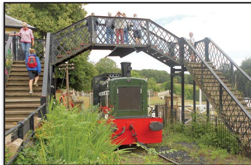
Hauling back up the one in thirteen gradient takes some effort

Overall, I think the event proved to be a pleasant day out. The unfortunate lack of steam operation understandably put some visitors off, but I'm sure those who did attend had a few hours of fun. Fawley Hill Museum is open to group visits (min. party of 10) four times a year with the next date in 2017. Visit their website to get in contact and to find out more. If you want a railway themed day out, it is highly recommended.