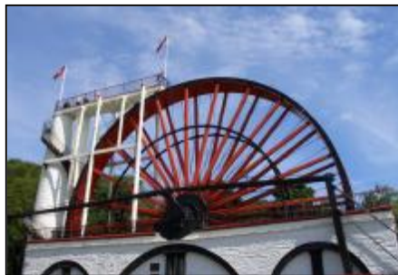
Isle of Man.

When we returned to Laxey it was still hot and sunny. We walked to the famous Laxey waterwheel "Lady Isabella" which was built for pumping water out of the local mineral mine more than 100 years ago. It has been extensively restored and is a working waterwheel, which is now part of the Heritage of the