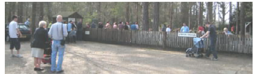
A good start to the 2007 season, with up to seven trains kept busy at Easter

Birthday parties have sold well but I still have two free dates on the running days in May and October. If anyone knows of someone interested in booking a party then please ask them to call me.