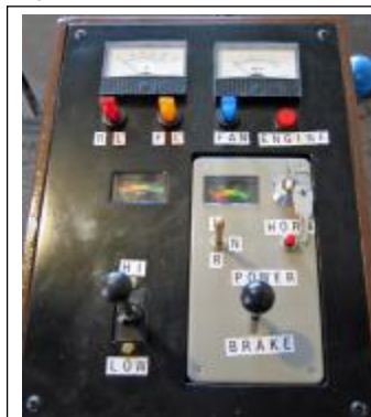
Peter's controller for his Class 73 EDL. The two meters are for the main and auxiliary batteries.

My discussions with the manufacturers revealed that if you use a 70Ah leisure battery you will only get 60% of that power (42Ah) before you should recharge it when the battery voltage is down to 12.3v. Some of the very newest leisure batteries can get about 70% of the rated capacity before recharge. If you run leisure batteries down below 12.2v it will damage the battery. It is recommended by the manufacturers that you have two sets so that you don't have to run the batteries flat as this shortens their life. They also recommend that after they have been used they are charged up as soon as possible as leaving a battery discharged will also shorten its life.