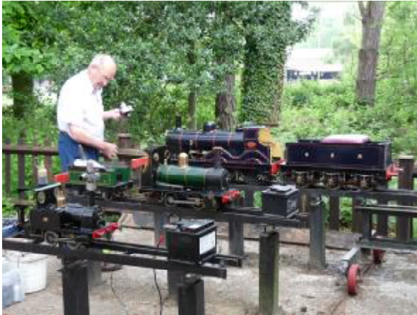
Early morning in the steaming bays.