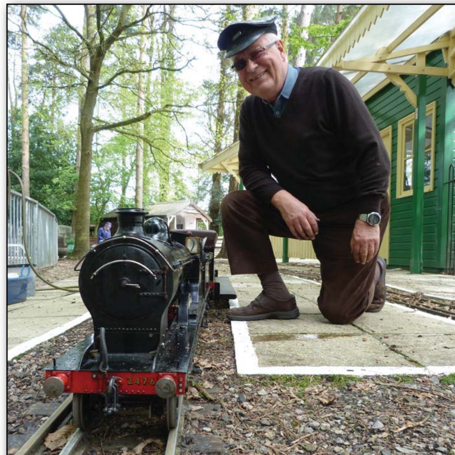
"I think I can remember how this works"

I'm sure you are aware car parking at the Centre can be quite tricky some times with a lot of vehicles moving around the site. We are very lucky to be able to park close to the railway. However, we would encourage you to use the main car park whenever possible. This allows us to keep the area near the railway for those that are bringing locos in, or need to bring tools on site. It also keeps us on very good terms with our neighbours.