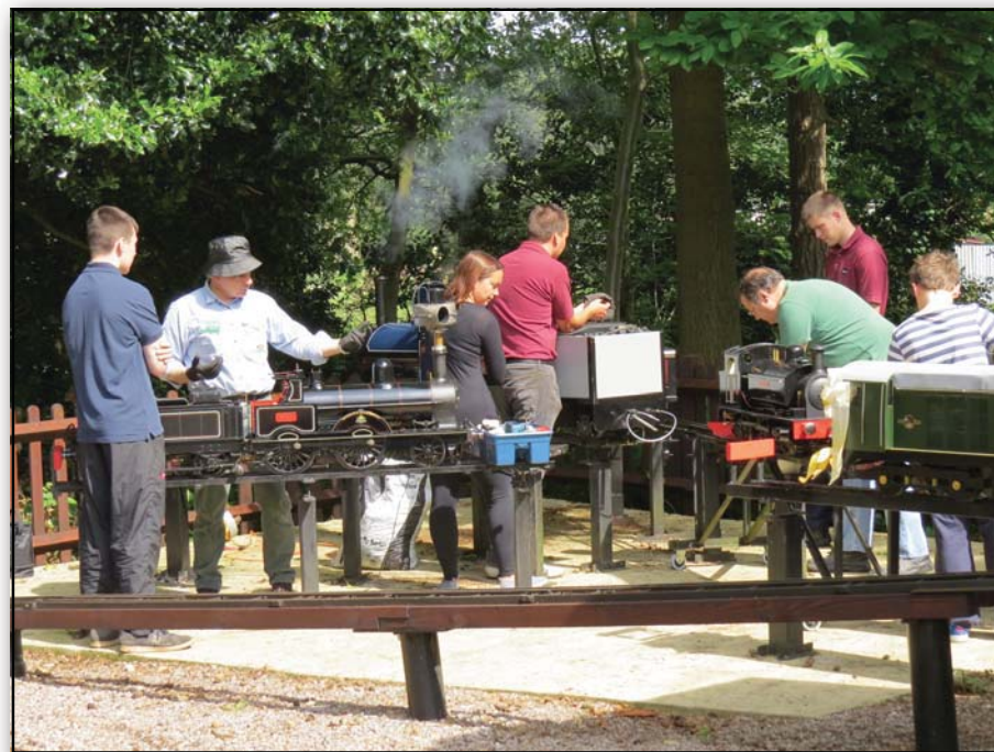
Busy times in the steaming bay on Visitors Day

I can report that the railway is operating well and that the infrastructure is in very good order thanks to the dedicated work of a number of people.