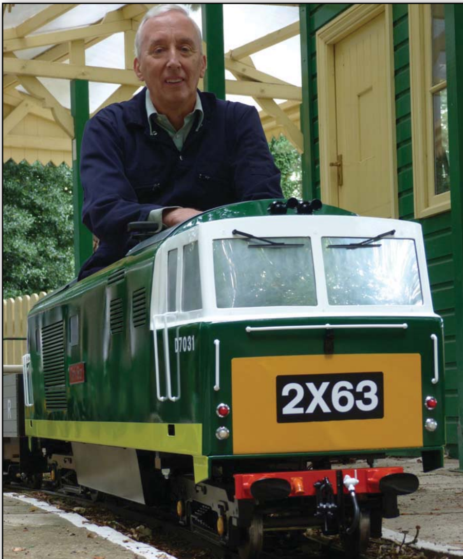
The new arrival on it's first outing