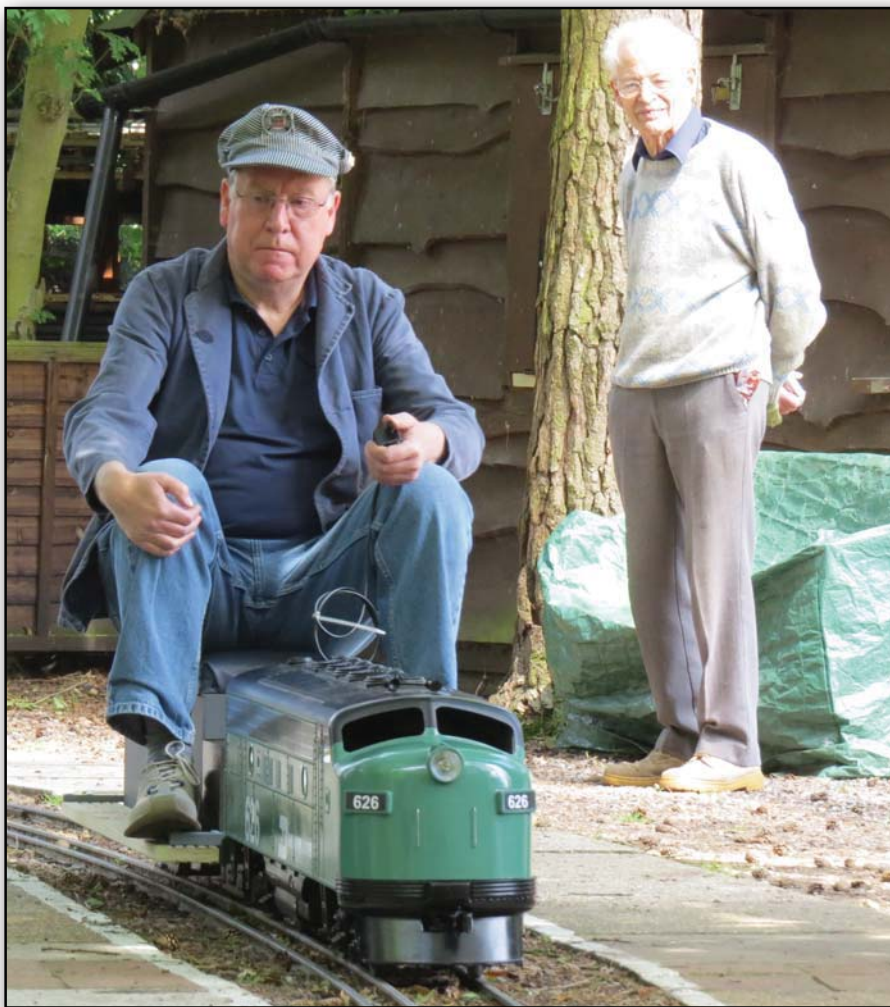
Not the sort of loco you see every day at Pinewood

There you have it, your railway is in good shape so make the most of it, come down and enjoy.