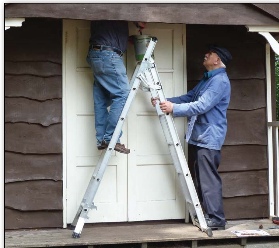
"I'm not sure it does exactly what it says on the tin mate!"

On a more mundane note our efforts are now aimed at maintaining our infrastructure, buildings, track, essential for smooth, often mentioned by visitors, and safe running.