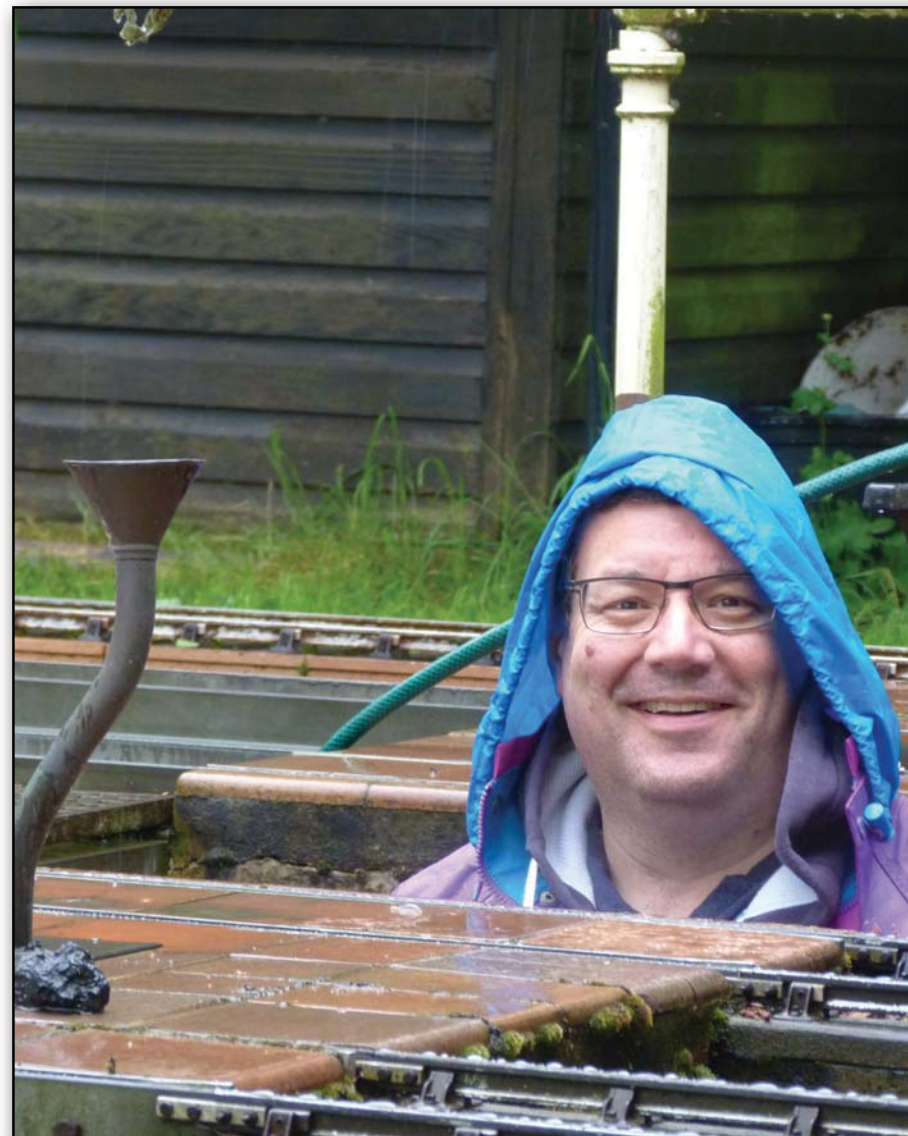
"I am not a Smurf!"